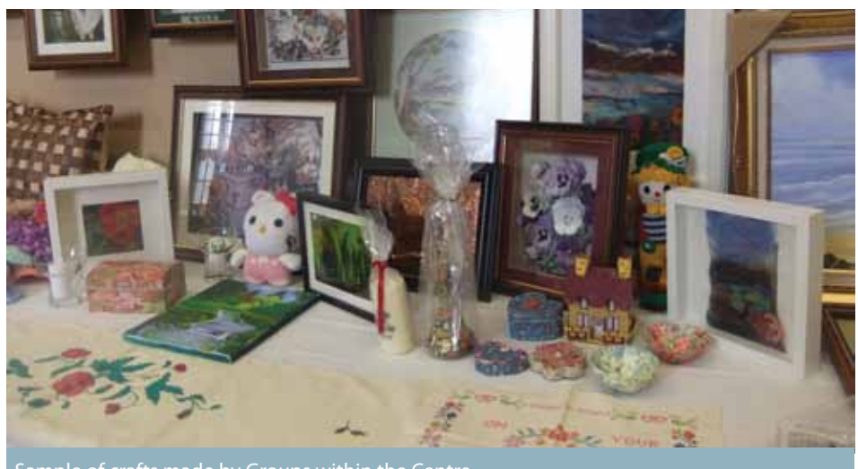
Sample of crafts made by Groups within the Centre