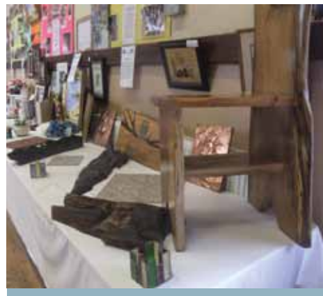
Arts & Crafts made by Groups in the Centre

The Clara Intergenerational Project brings together the older and younger generations of the community. For an hour once a week local school children have the chance to meet with senior citizens and listen to their stories and experiences and to learn about their local heritage and past history of Clara. If you would like to come along and share your stories you would be very welcome at the Centre on Thursday mornings in September and October at 11.15am.