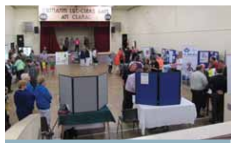
Groups showing their displays at the Pride of Place Judging Day

TIPS group meet on Mondays 10am -12pm at the Centre. Lots To Do meet at the Centre every Wednesday 9.30am to 12pm. TIPS Open morning October 5th Come along for music, movement and a puppet show. Everyone welcome.